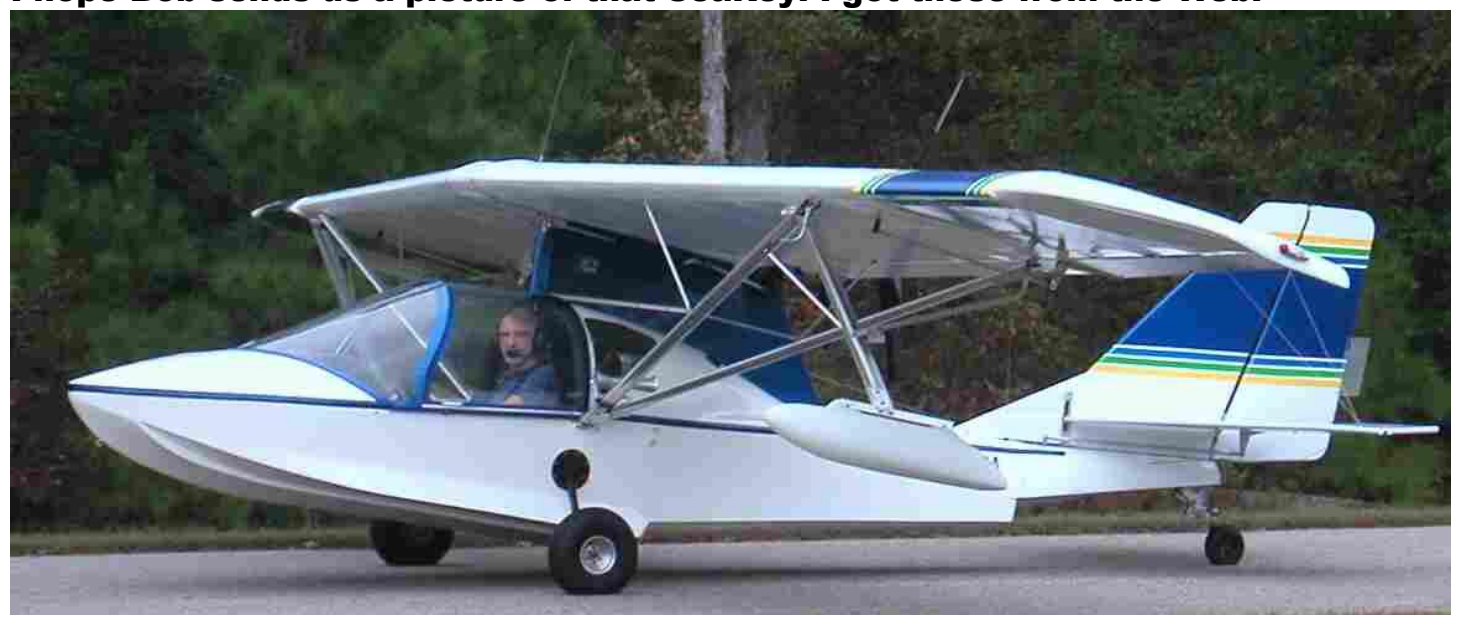
I hope Bob sends us a picture of that SeaRey. I got these from the Web: