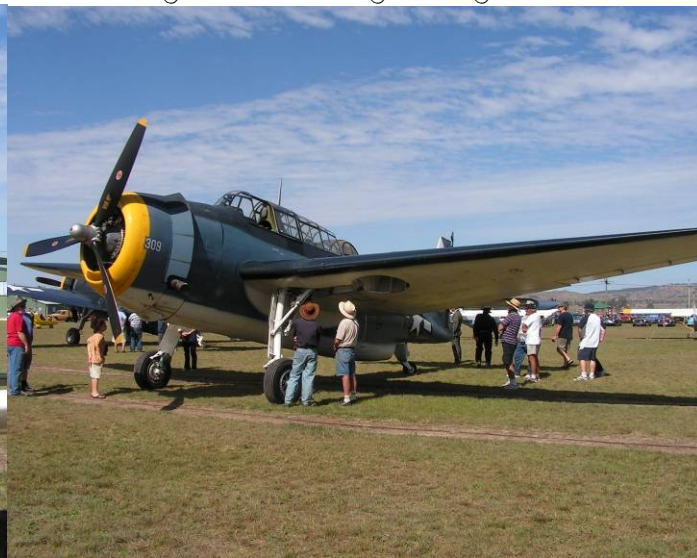
There are boys who have very big toys