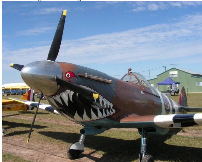
Somebody obviously has a lot of fun