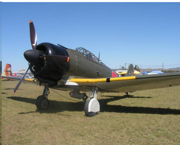
Tora Tora Tora!