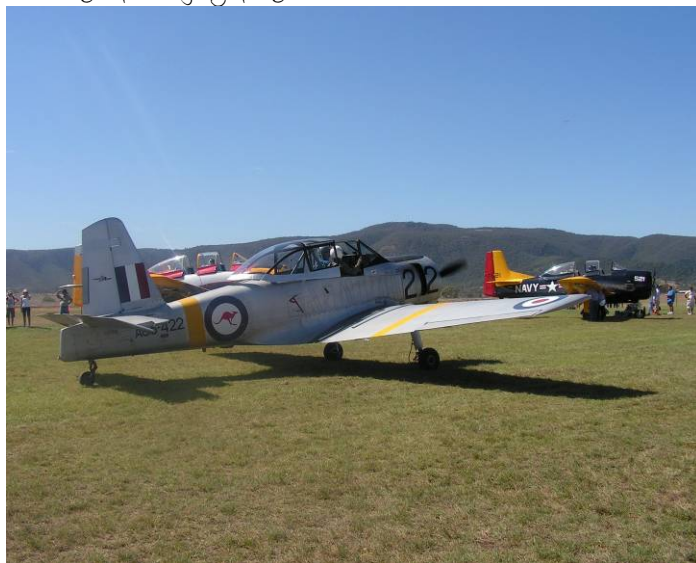
Let's go for a joy flight