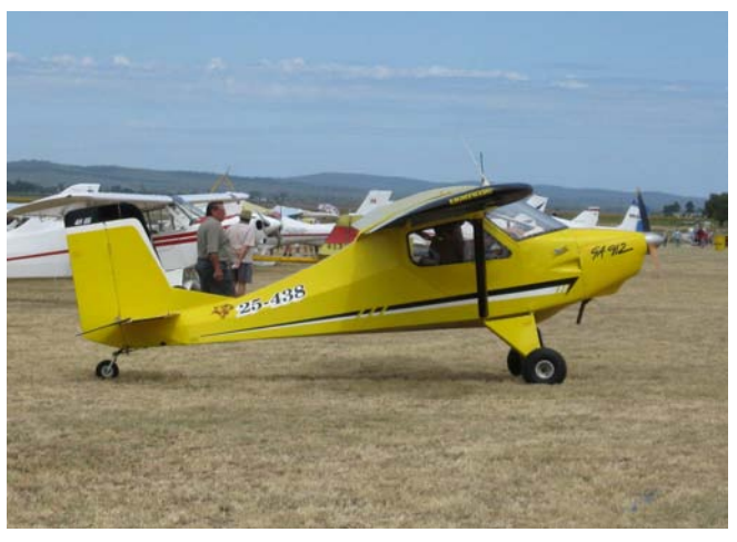
Above are a vintage Quicksilver MX11 and Hughes Light wing arriving at Clifton.

Watts Bridge Memorial Airfield Inc. All-In Fly-In Airfield Open Day 23<sup>rd</sup> May 2009 All pilots and aviation enthusiasts are invited to the Watts Bridge Airfield Open Day to celebrate the rich diversity of all forms of recreational aviation. Watts Bridge Airfield, situated in the Brisbane Valley, is the home base for a wide range of aircraft including Vintage, Aerobatic and Recreational Aircraft as well as Gyroplanes, War Birds and a variety of Homebuilt Aircraft. Free entry with no landing fees.