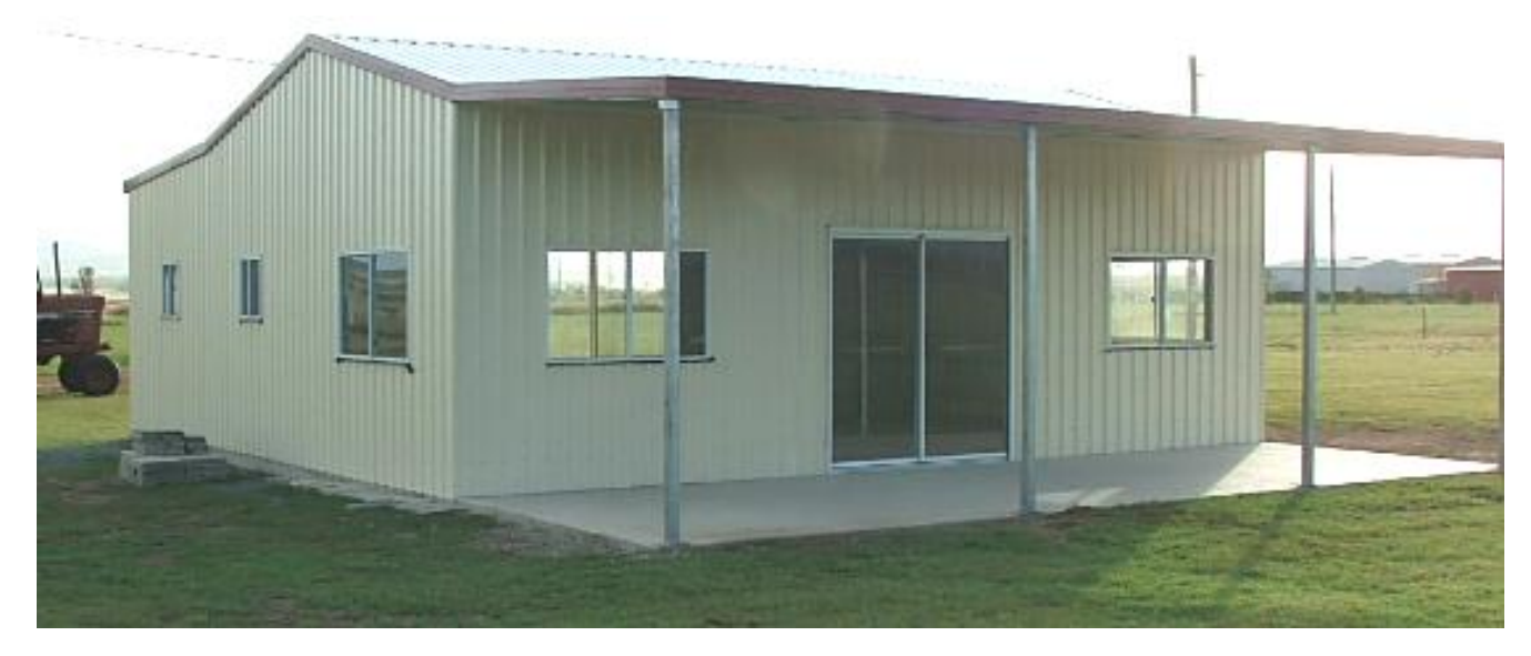
The above picture shows the recently constructed QUA Inc Clubhouse at Watts Bridge.

The building was assembled by Chris Gratton Sheds to the lock up stage just prior to Easter. Following inspection, the building was paid for by QUA funds. When time and money is available, the fit out process can commence to make the building more useful for QUA activities. No doubt this can be discussed in more detail at the April meeting. The first official clubhouse activity planned is the May general meeting on Sunday the 11<sup>th</sup> from 10.00am. A BBQ is planned after the meeting for those who can attend or fly-in.