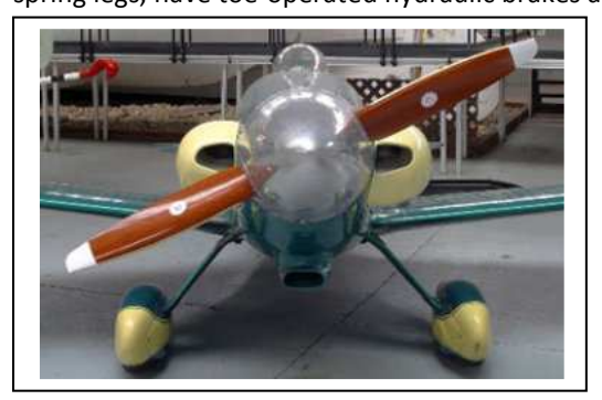
The 'Wind". Note the monstrous spinner and the tiny bubble canopy above it.

loadings. The extremely clean wing, with a span of only 5.94 metres, carries virtually full-span ailerons that give prodigious roll rates while the elevator and rudder are also exceptionally powerful. The aircraft is starkly simple. It has no drag-inducing or high-lift devices or trimmers. The tailwheel, although tiny and solid-tyred, is mounted in the base of the rudder and offers precision ground steering. The main wheels, mounted on leaf-spring legs, have toe-operated hydraulic brakes and offer easy handling on grass or bitumen. The cockpit has