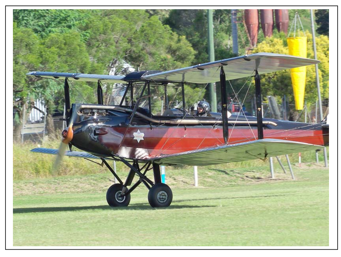
DH-60 Gypsy Moth, VH-UMK, flies again, at Boonah. See story page 6.

Watts Bridge Memorial Airfield, Cressbrook-Caboonbah Road, Toogoolawah, Q'ld 4313.