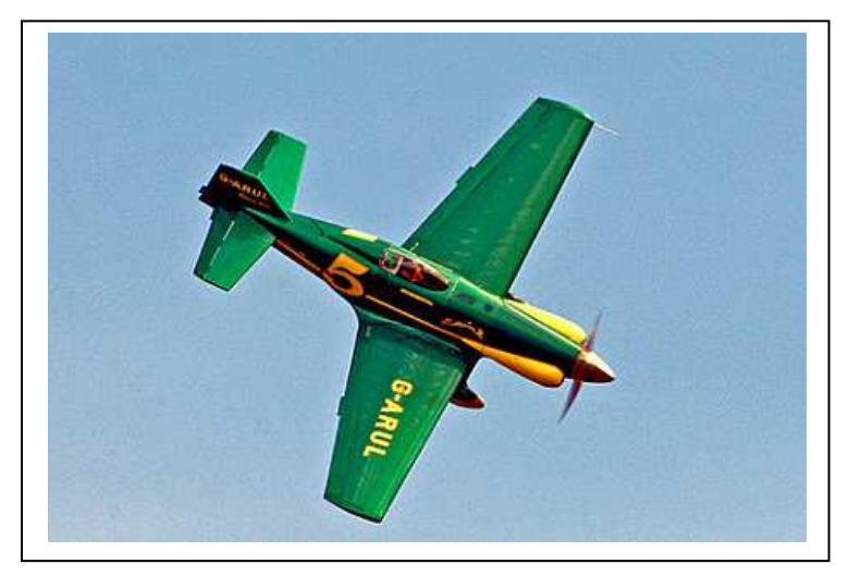
A jet fighter on just 85 hp.

Before doing anything more with the Wind I wanted to assess the stalling behaviour, particularly under acceleration, and, at 3,000 ft, flew to the east of Biggin Hill. I wanted plenty of height to spare. It was then that I gave myself my nastiest moment by throttling back and cutting off the fuel instead of applying carburettor heat. I wrestled beyond the instrument panel to find a fuel cock I had never seen - and would never see anyway – until, with a good thrust with my right toe, I finally found it and fuel flowed again. I found that the Wind's initial stalling characteristics are interesting insofar as the long-span ailerons will stall a wing at well above the real stalling speed with any coarse control application. From about 60 kts downwards I managed to stall each wing with aileron, then achieved full-blooded aileron reversal and finally got the stick firmly back at about 55 kts. The nose hardly dropped and there was ample rudder to juggle the aircraft downhill in a level attitude. There was no apparent inclination to spin, but I lost well over 1,000 ft during my slow and rather experimental deceleration to the full stall. There was virtually no warning of the stall onset and the stalled wing dropped hard and noisily, though not far. My overall impression was of