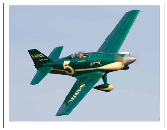
Quite the most exhilarating small aircraft in the British Isles.

The next time I arrived a touch slower and lower; there being much more sink available at this reduced airspeed. The float was indeed lengthy and visibility not too good over the nose, but control was so precise and easy that I found I could accurately brush the wheels on the ground when the time came. Directional control on the ground was excellent and the actual run not too long, though the usual bucking made progress rather blurred. Provided one achieves a key position—speed and height correct over the threshold—there are no problems at all and landing was delightfully easy. Speed and height on the final approach have to be juggled with care, just as they do in any low-drag aircraft, but the overshoot is sufficiently positive to make another try well worth making if there is any doubt. My second landing was in a fairly strong crosswind, but by approaching slightly wing-low I had no trouble in countering drift and felt absolutely no effects once on the ground. One could approach rather more slowly but only at the risk of experiencing the various pre-stall phenomena, particularly in bumpy weather.