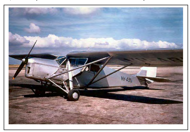
Australian Puss Moth VH-ABU (ex VH-UPA imported for QANTAS).

It was very gentlemanly – there really is no other way of describing it. Initially the roll rate felt a little slow, but I soon got the feel of it as we climbed away at 60mph (53 kts), giving us about 550fpm. This, with two up and