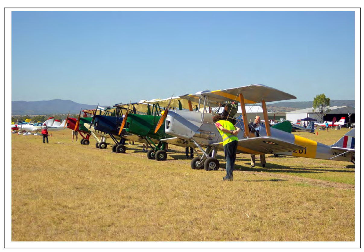
Watts Bridge, Gathering of Eagles 2014. Which one's not a DH82a?

Watts Bridge Memorial Airfield, Cressbrook-Caboonbah Road, Toogoolawah, O'ld 4313.