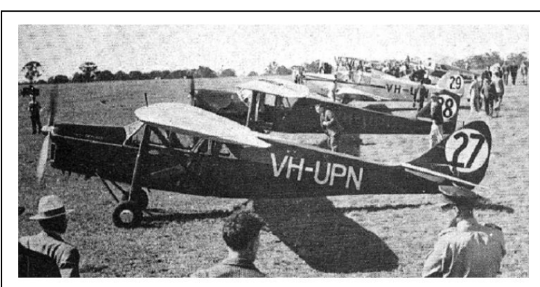
Another Australian Puss Moth - VH UPN

to the crosswind over the trees, I added 10mph to the normal approach speed of 60 (53 kts) to allow for any possible loss of speed. Typically, no such thing happened, and the net result was a prolonged float followed by a nice landing halfway down the strip with no tendency to swing. All very satisfying, and resulting in the inevitable silly grin.