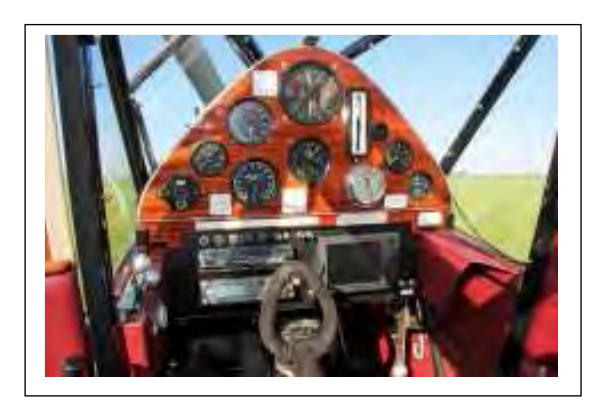
Puss Moth panel.

De Havilland decided that a faster, more luxurious aircraft should be the next step in the growing market – and the idea for the Puss Moth was born. The majority of production Puss Moths were two-seaters in tandem configuration, but a few were