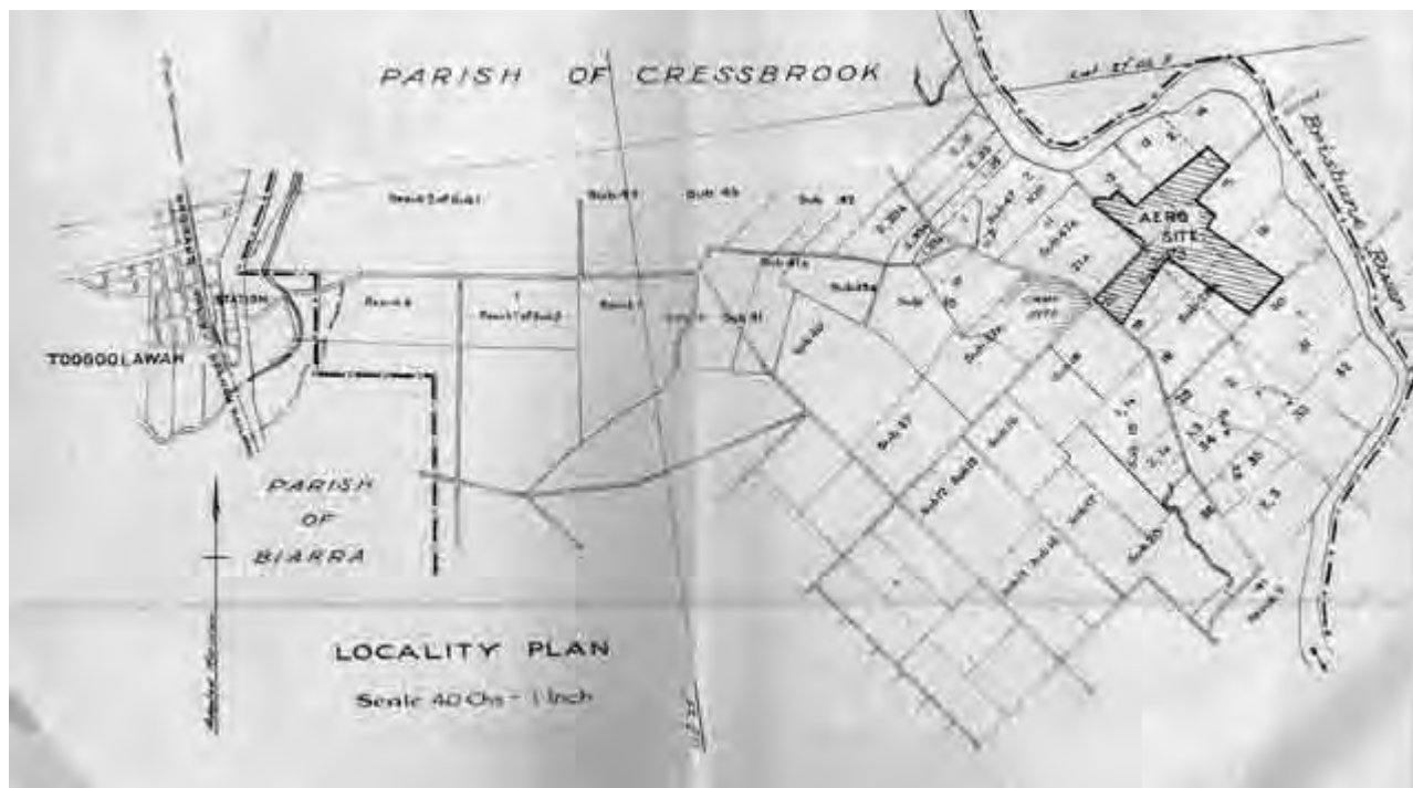
An original map showing the allocation of land for the airfield