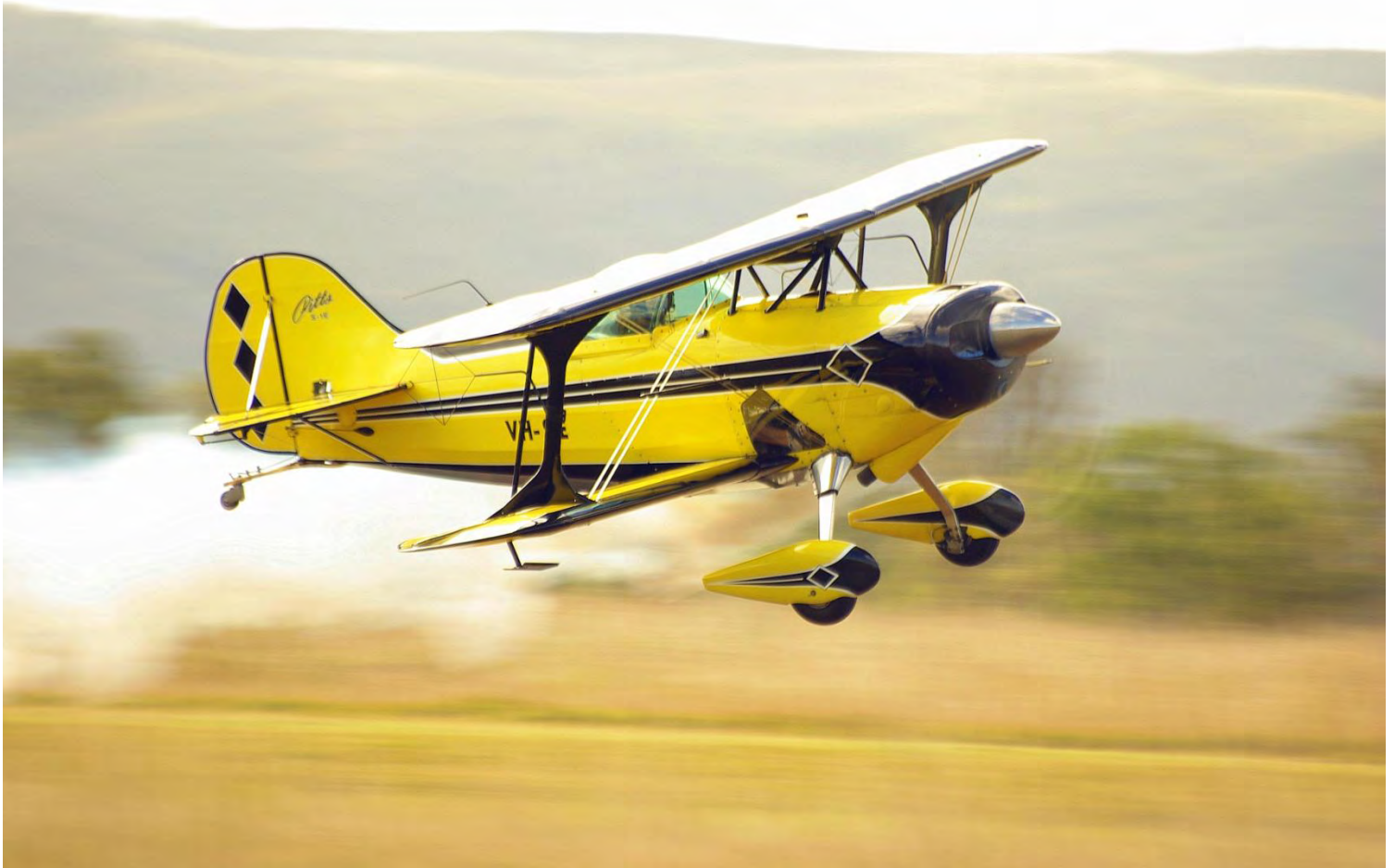
Two photos from Watts Bridge more recent past (2011 All in Fly in)