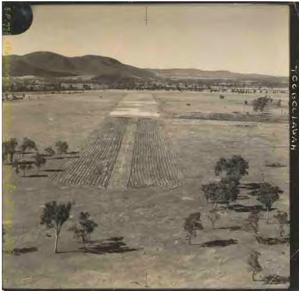
Photo Above: 12/30 looking from the north-west end (runway 12) looking east. Photo taken 17 August 1942

The camp appears to consist of a number of tents close to the Brisbane River, with easy access to Silverleaves Rd.