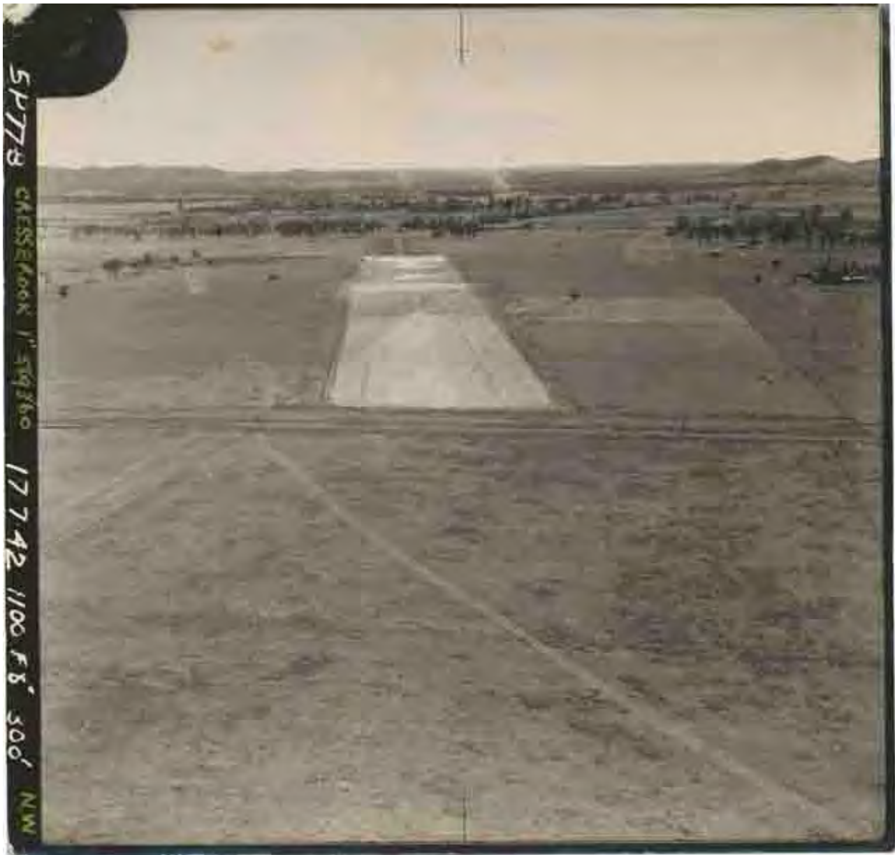
Photo Above: Runway 12/30 looking from the south-east end (runway 30) looking west. Photo taken 17 August 1942

From the records in the National Archives of Australia, the first evidence of aerial activity by a 5 SQN aeroplane seems to be when P/O Ron Forsyth flew across from Toowoomba on the 7th July 1942 as per the extract below from 5 SQN's operations record book shows